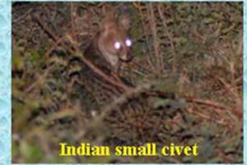
Indian small civet