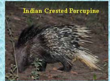
Indian Crested Porcupine