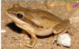
Common Tree Frog