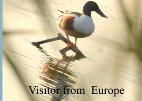
Visitor from Europe