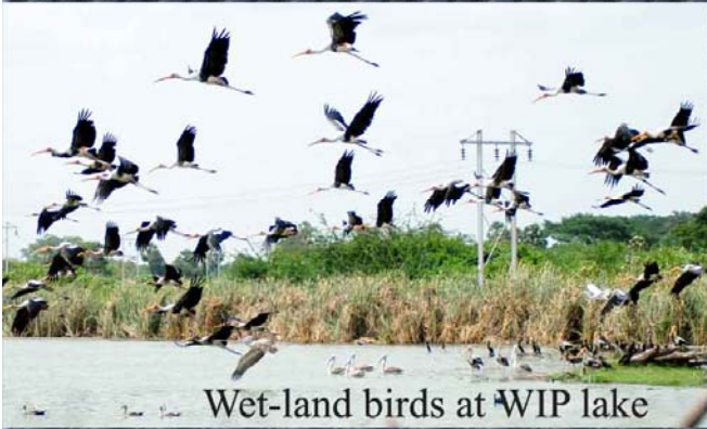
Wet-land birds at WIP lake