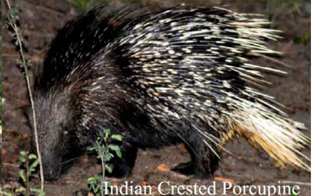
Indian Crested Porcupine